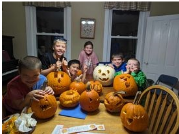
October pumpkin carving event